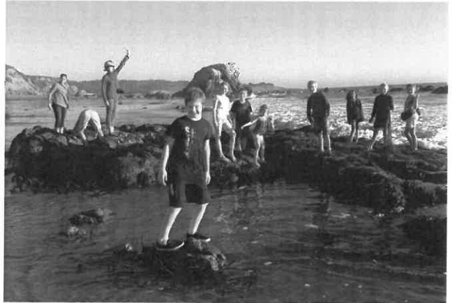
MV students explore tide pools at San Simeon