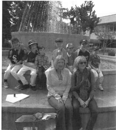
FSU: Peach Blossom Festival