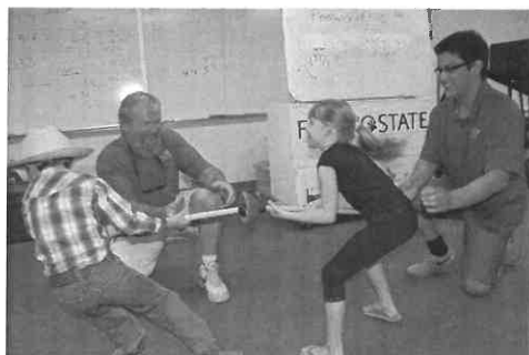
FSU Physics Outreach